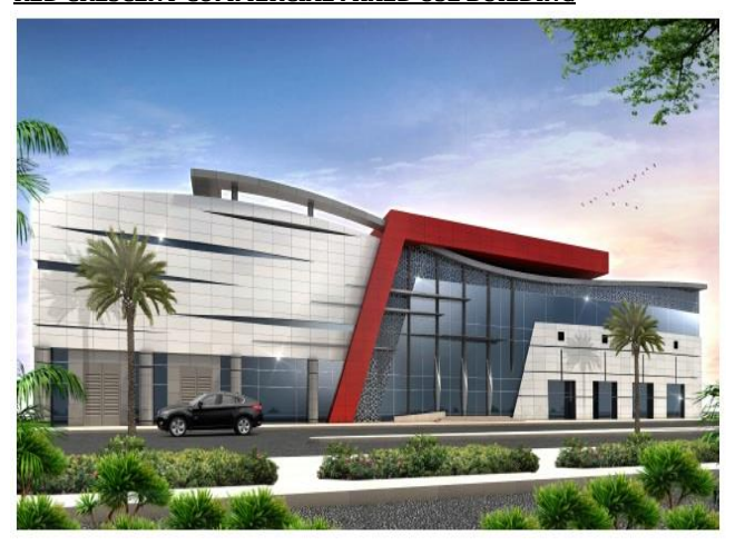
CLIENT: Emirates Red Crescent CONSULTANT: Bainona Engineering Consultancy CONTRACTOR: Galaxy Universal Contracting