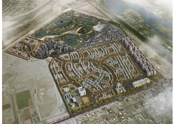
CLIENT: Al Dar Properties PJSC CONSULTANT: Pace Engineering Consultants CONTRACTO: Tafseer Contracting & Gen. Maintenance Co. L.L.C