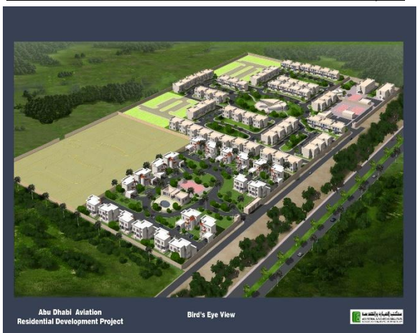
CLIENT: Sorouh CONSULTANT: Architectural & Engineering Consultants CONTRACTOR: Actco General Contracting Co. L.L.C