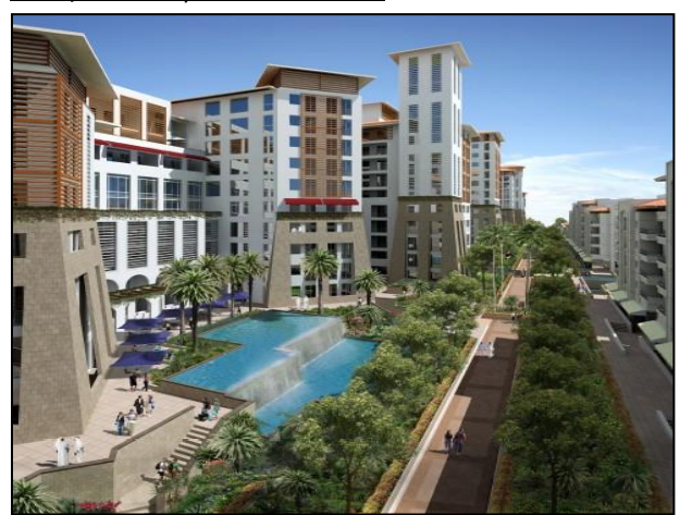
CLIENT: Al Dar Properties PJSC CONSULTANT: Architecture & Planning Group CONTRACTOR: Al Fara'a General Contracting