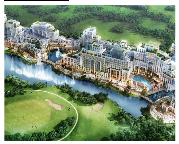
CLIENT: Damac CONSULTANT: KEO International Consultants CONTRACTOR: Ghantoot Gulf Contracting