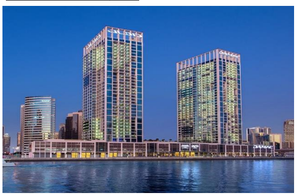
CLIENT: Damac CONSULTANT: Namaa Properties Development CONRACTOR: Seidco General Contracting