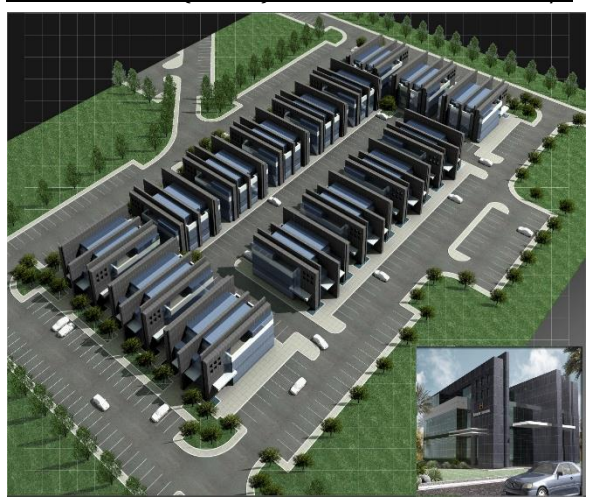
CLIENT: Link Investment CONSULTANT: Heberger Engineering Consulting Engineers CONTRACTOR: Ali & Son's Contracting Co. L.L.C