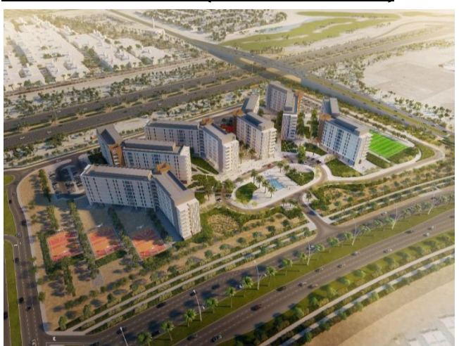
CLIENT: Al Dar Properties PJSC CONSULTANT: KEO International Consultants CONTRACTOR: Fibrex Construction Group