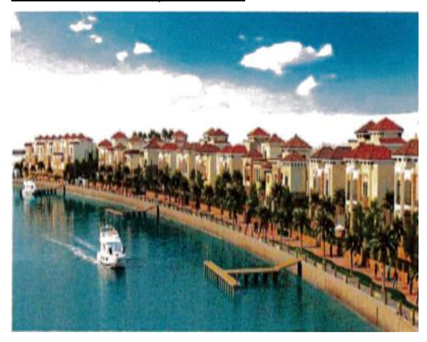
CLIENT: International Capital Trading (ICT) CONSULTANT: EWAN Architectural & Engineering Consultancy CONTRACTOR: Galaxy Universal General Contracting