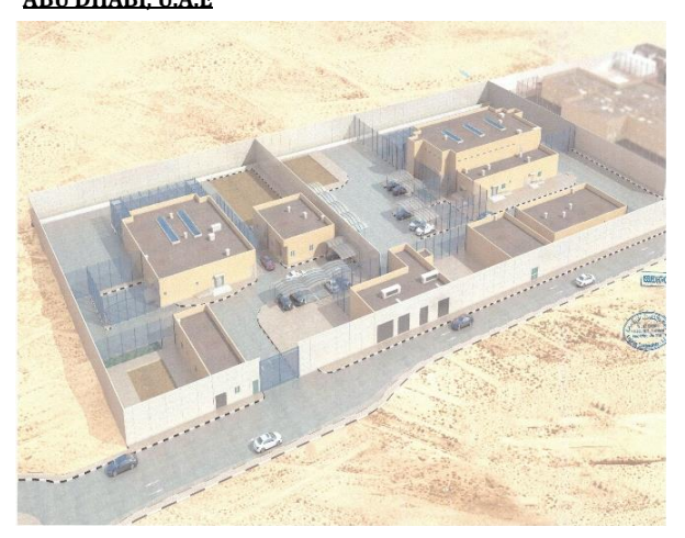
CLIENT: Crown Prince Court CONSULTANT: Architecture& Planning Group CONTRACTOR: Arabtec Construction L.L.C