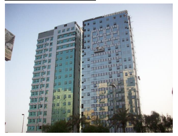
CONSULTANT: Heberger Engineering Consulting Engineers CONTRACTOR: Bin Hermal General Contracting L.L.C