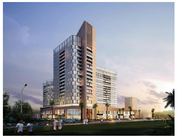
CLIENT: International Capital Trading CONSULTANT: EHAF CONTRACTOR: Seidco General Contracting