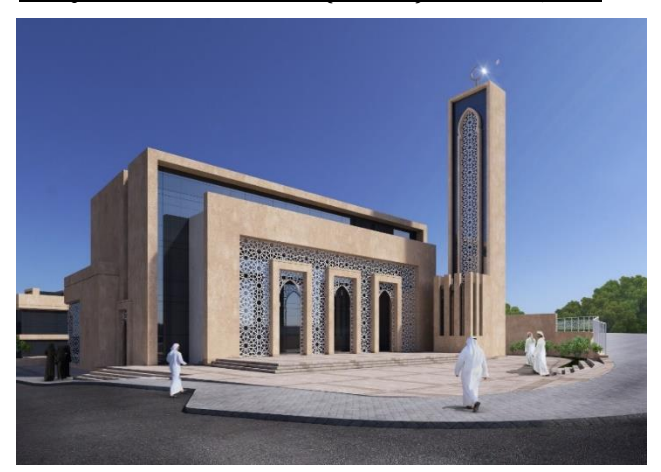
CLIENT: International Capital Trading (ICT) CONSULTANT: Bainona Engineering Consultancy CONTRACTOR: Galaxy Universal Contracting