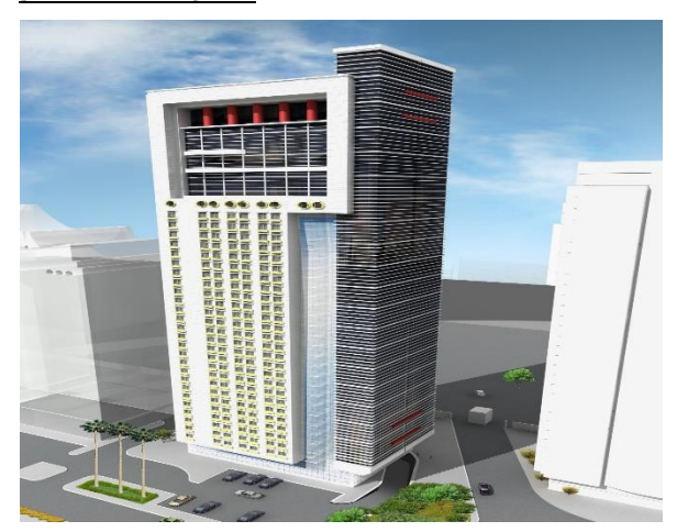
CLIENT: International Capital Trading CONSULTANT: Bainona Consulting Engineering CONTRACTOR: Seidco General Contracting