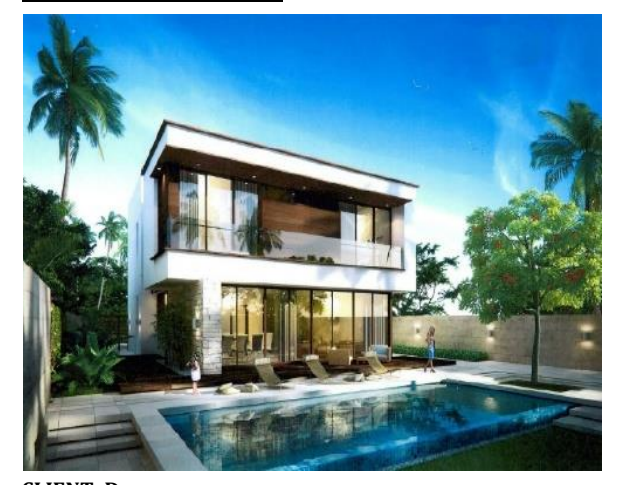
CLIENT: Damac CONSULTANT: Naga Architects, Designers & Planners CONTRACTOR: Ghantoot Gulf Contracting