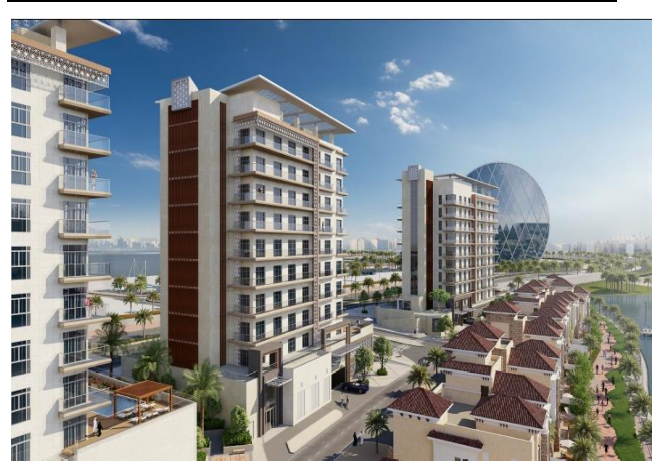
CLIENT: International Capital Trading (ICT) CONSULTANT: EWAN Architectural & Engineering Consultancy CONTRACTOR: Dhabi Contracting L.L.C